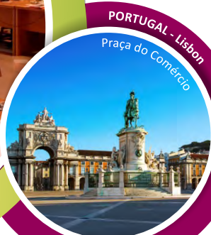
PORTUGAL - Lisbon Praça do Comércio